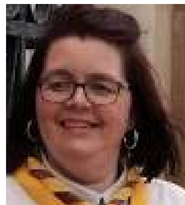
CUB TEAM LEADER

What do you find the most rewarding about volunteering with young people?