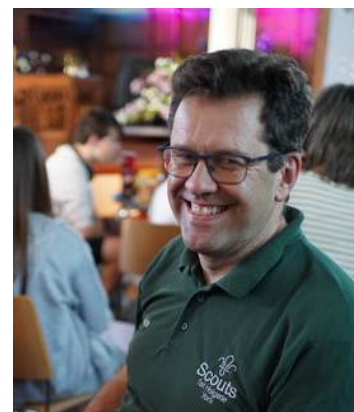
EXPLORER TEAM LEADER

What's one of your favourite memories or proudest moments from your time volunteering with the Explorers so far?