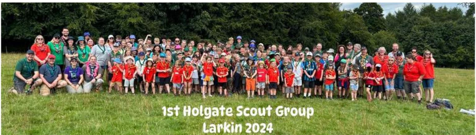
1st Holgate Scout Group Larkin 2024